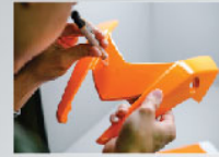
Color Match Consistency