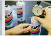
Canister QC Control

More than 300 colors over 35 years Rigorous product testing & quality control